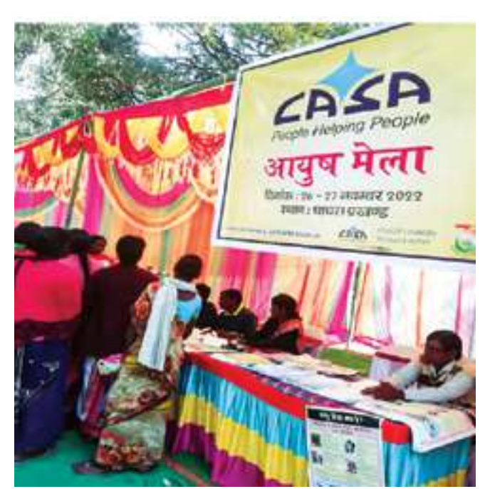
Pic: Empowering Health and Knowledge at Ayush Mela 2022: CASA's Dedication to Community Well-being

CASA's engagement showcased its commitment to promoting community health through education, awareness, and access to essential emergency health services. By actively participating in such events, CASA continues to empower communities with knowledge and tools for healthier, more fulfilling lives.