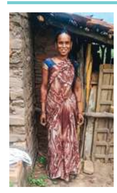
Embracing Singlehood and Rising as a Leader

Through CASA's intervention and support, the kitchen garden has not only provided the Gond family with a diverse and nutritious diet but has also transformed their economic condition. Their successful venture has inspired others, creating a ripple effect within the community. By promoting sustainable farming practices and encouraging the cultivation of kitchen gardens, CASA has contributed to the improved food security and livelihoods of marginalized communities, empowering them to lead healthier and more prosperous lives.