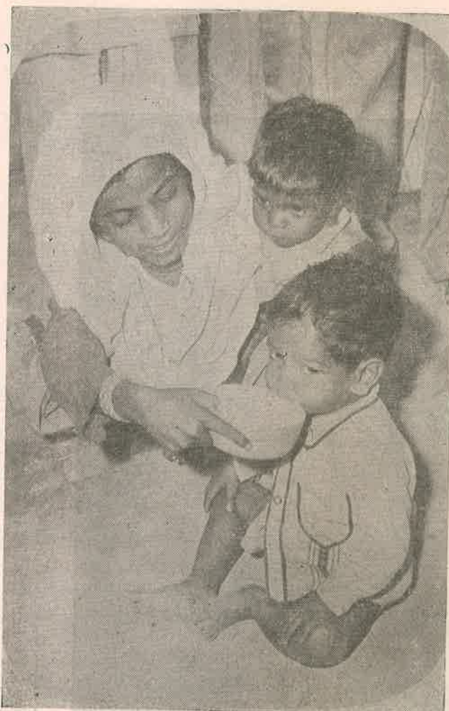
Responsibility falls on young shoulders. A nine year old girl feeding kid brothers with milk provided for them under CASA's Maternal and Child Health Programmes.