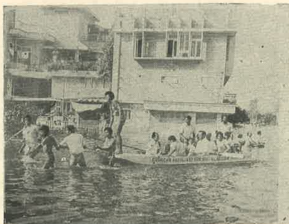
CASA motor boats being used for the evacuation of flood victims in Delhi. Students from Delhi University assisting CASA personnel in relief work.