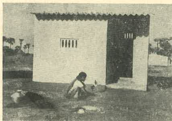
One of the semi-permanent tubular houses in Machilipatnam which were constructed in CASA's Phase II Rehabilitation Programme taken up as a result of the devastating cyclone of November 1977 which hit the coastal regions of Andhra Pradesh.