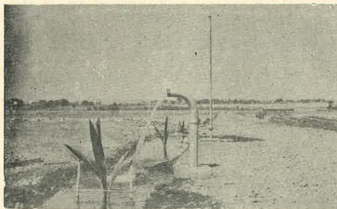
A tube-well functioning; filling a small canal which has several tributaries leading into the fields. This helps in irrigating hundreds of acres of land previously lying unproductive due to shortage of water.