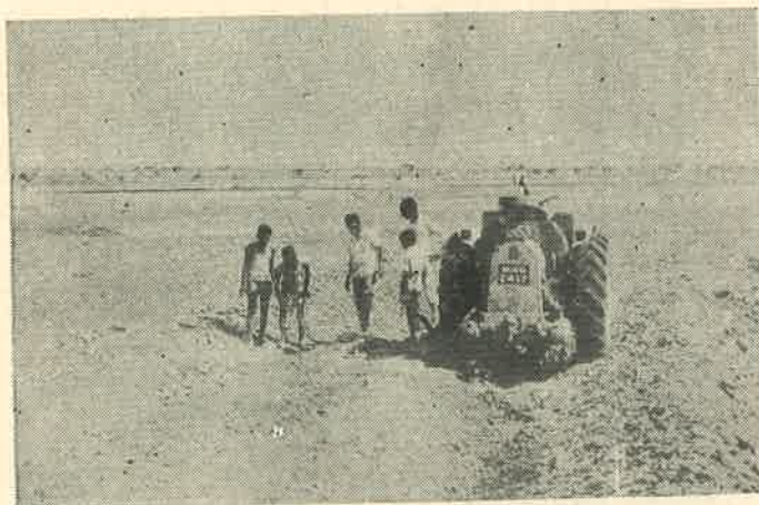
The commencing of a new project. Drilling work begins for sinking of a tube-well. Hope is once more kindled in the villagers who are surrounded by unproductive land but will soon see green fields all around.