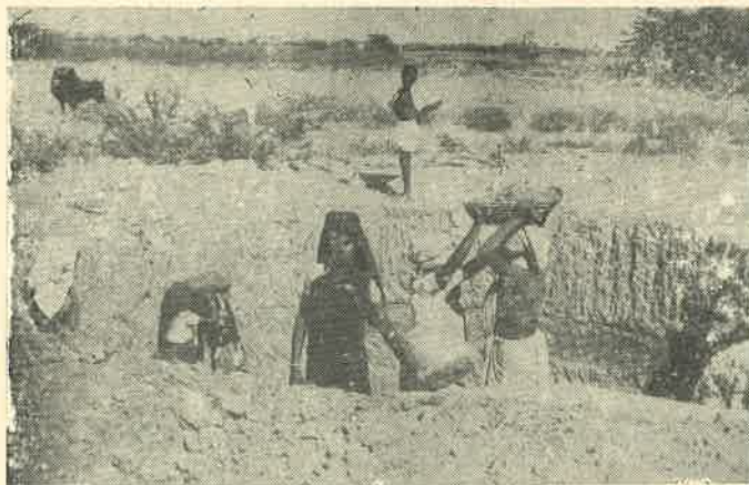
Women lend a hand in digging an open Well under CASA's food-for-work programmes. The Well will give the villagers better drinking water facilities and also a source of employment to those engaged in the work.