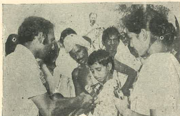
Immunization programme under-way. CASA medical teams using pedo-jets to inoculate flood victims in Midnapore district of West Bengal, thus protecting them from various fatal diseases like Cholera, Typhoid, Gasto-Enteritis, etc. easily communicable through water pollution and unhygienic living condition.