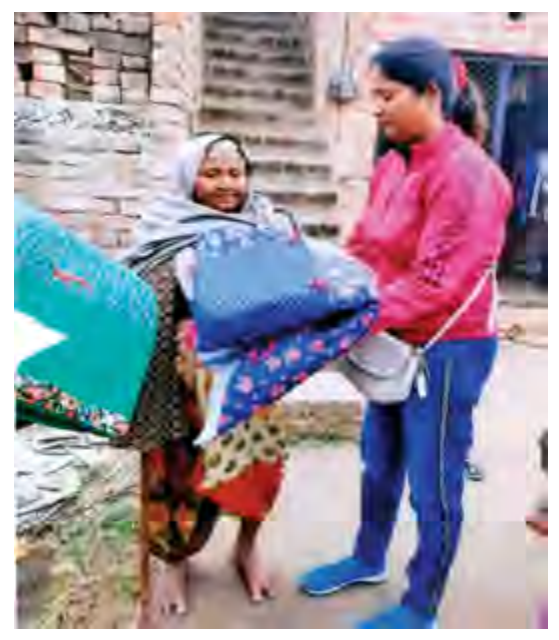
Quilts distributed to the senior citizen by Society of under Privileged, Allahabad, Uttar Pradesh to protect from the severe cold during winter season.